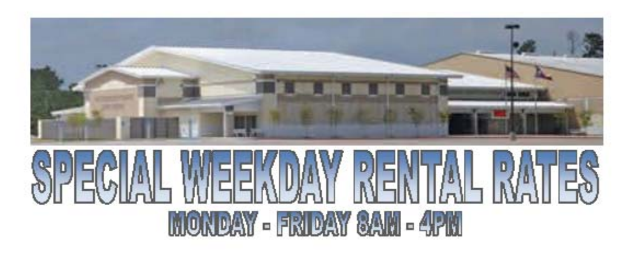
EXHIBIT "A" continued Nacogdoches County Civic Center

We offer Special Weekday Rental Rates Monday thru Friday (excluding county holidays) from 8:00 am to 4:00 pm. Our facility offers a variety of meeting and conference room capable of accommodating large and small groups. Housekeeping during your event and clean-up afterward is provided.